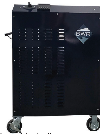
Portable & discreet system