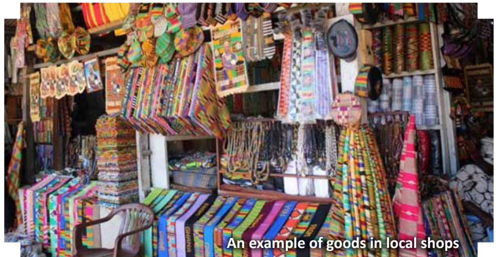
An example of goods in local shops

For a taste of Ghana at home, try this delicious and easy-to-make dinner recipe.