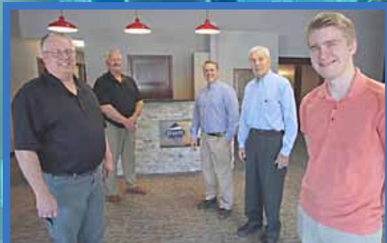
The BWR Innovations Management Team.