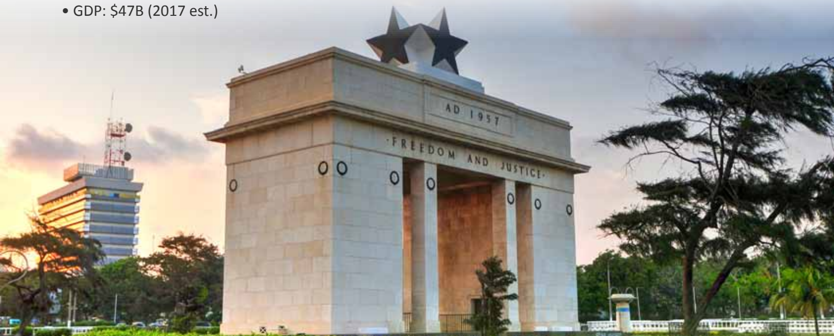
Independence Arch, Accra, Ghana